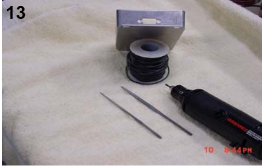
Detail DB9 opening's) - make it pretty