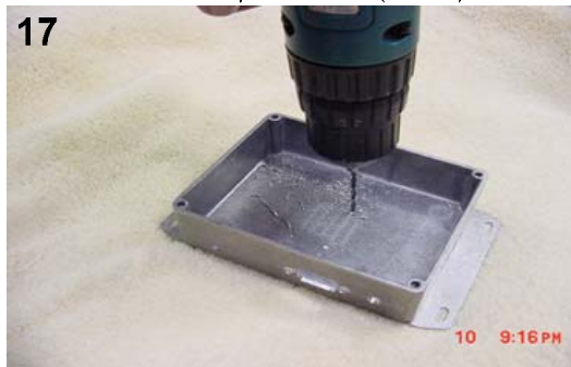
Drill GPS and TT3 spacer holes (4 total)