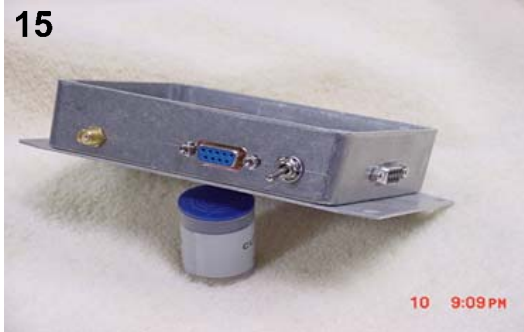
Verify location, fit, and finish