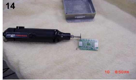
Notch TT3 board for DB9 mounting hardware clearance